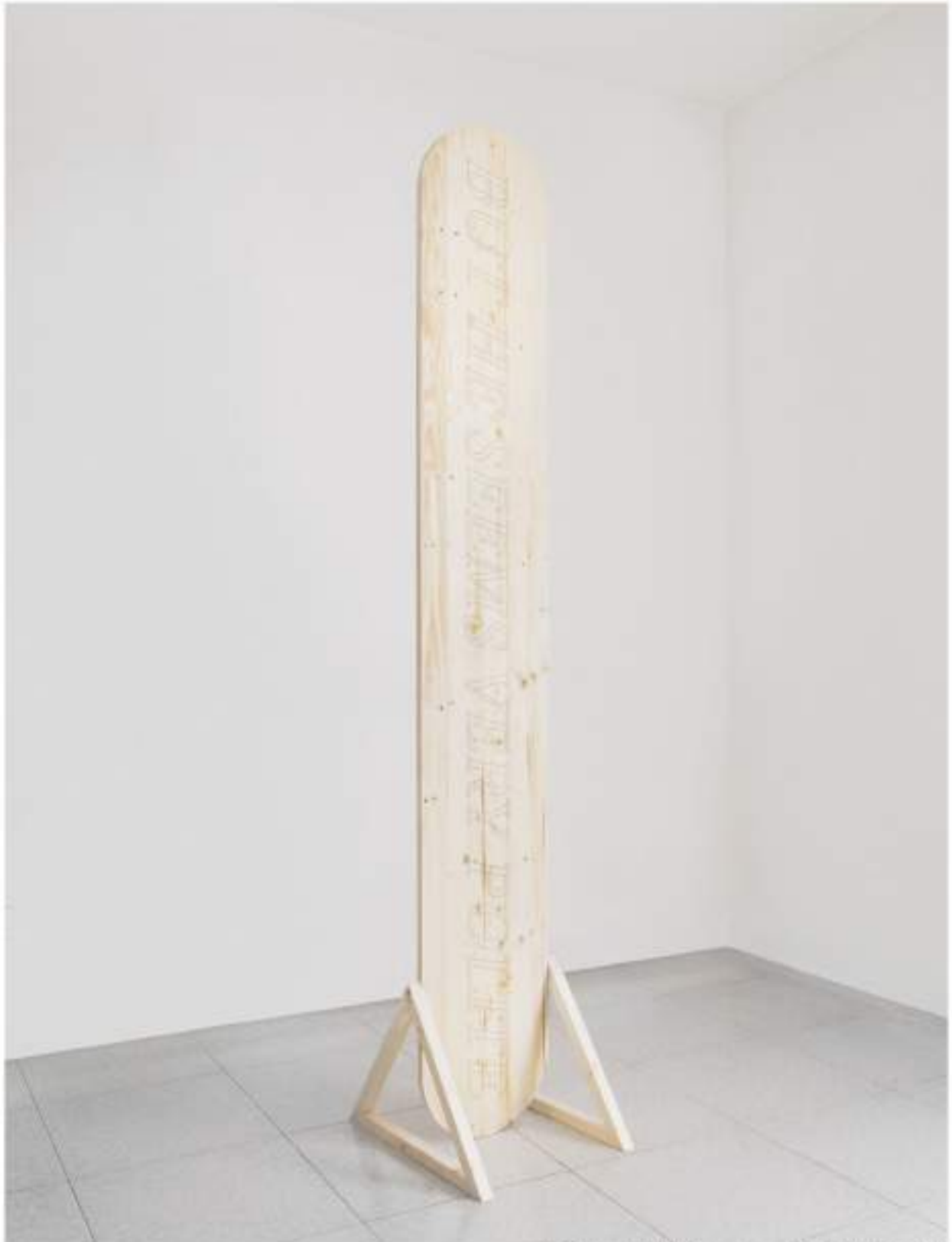
I don't know who he is but he seems very polite, installation view, 2019

I don't know who he is but he seems very polite