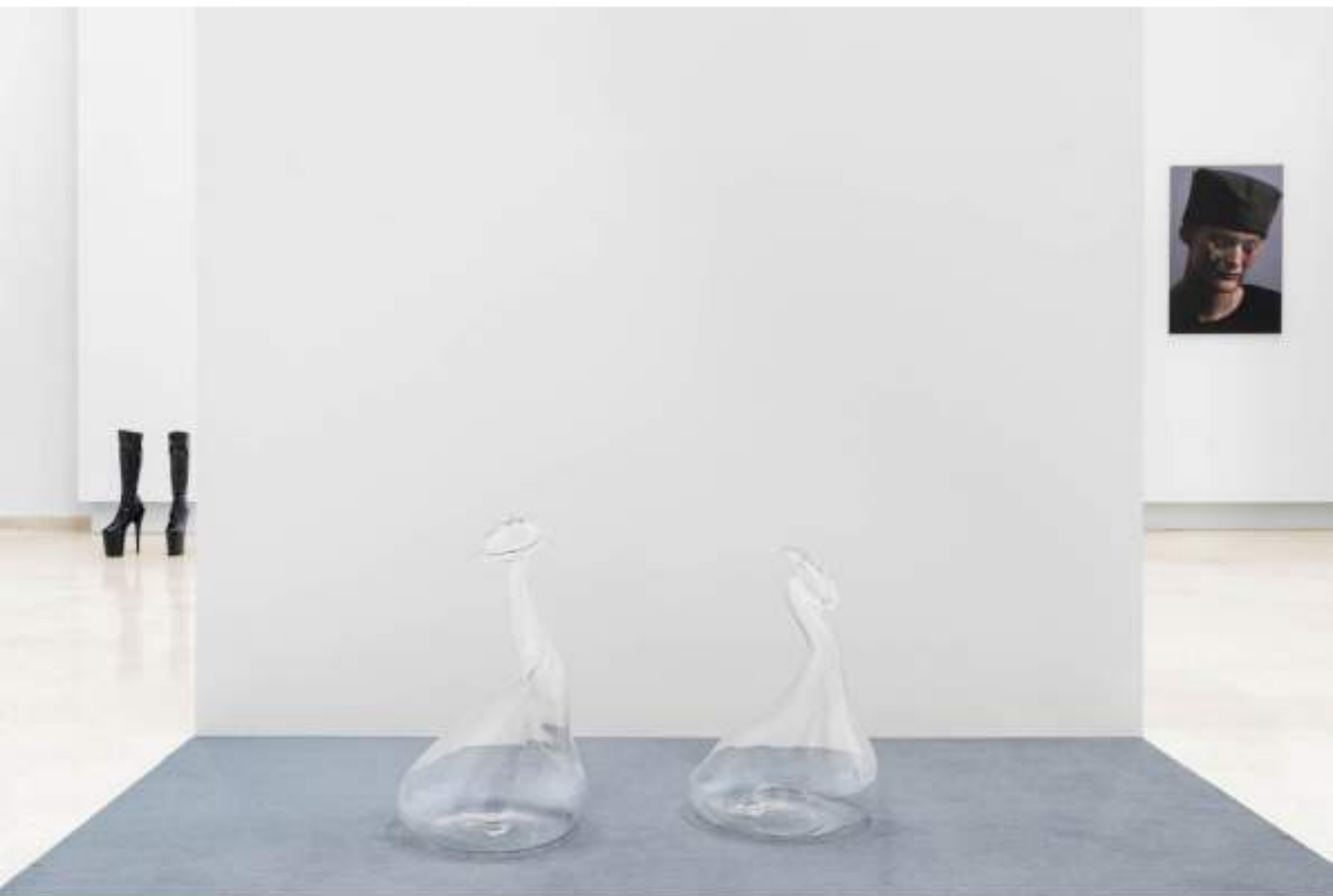
Léonard Santé, 13 poems, installation view, Quadriennale di Roma, Roma 2020

2020 poetry reading-performance black fetish boots 20 minutes Quadriennale di Roma, Roma IT