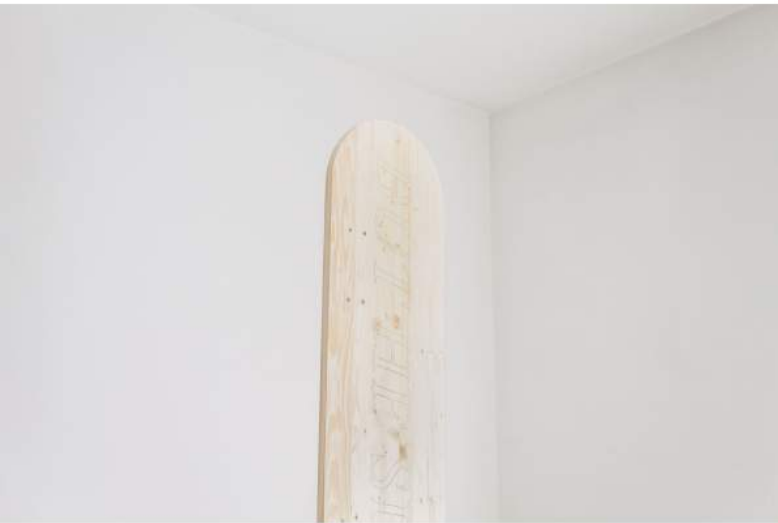
I don't know who he is but he seems very polite, installation view (2019)

2019 sculpture wood, charcoal 200x45x34cm