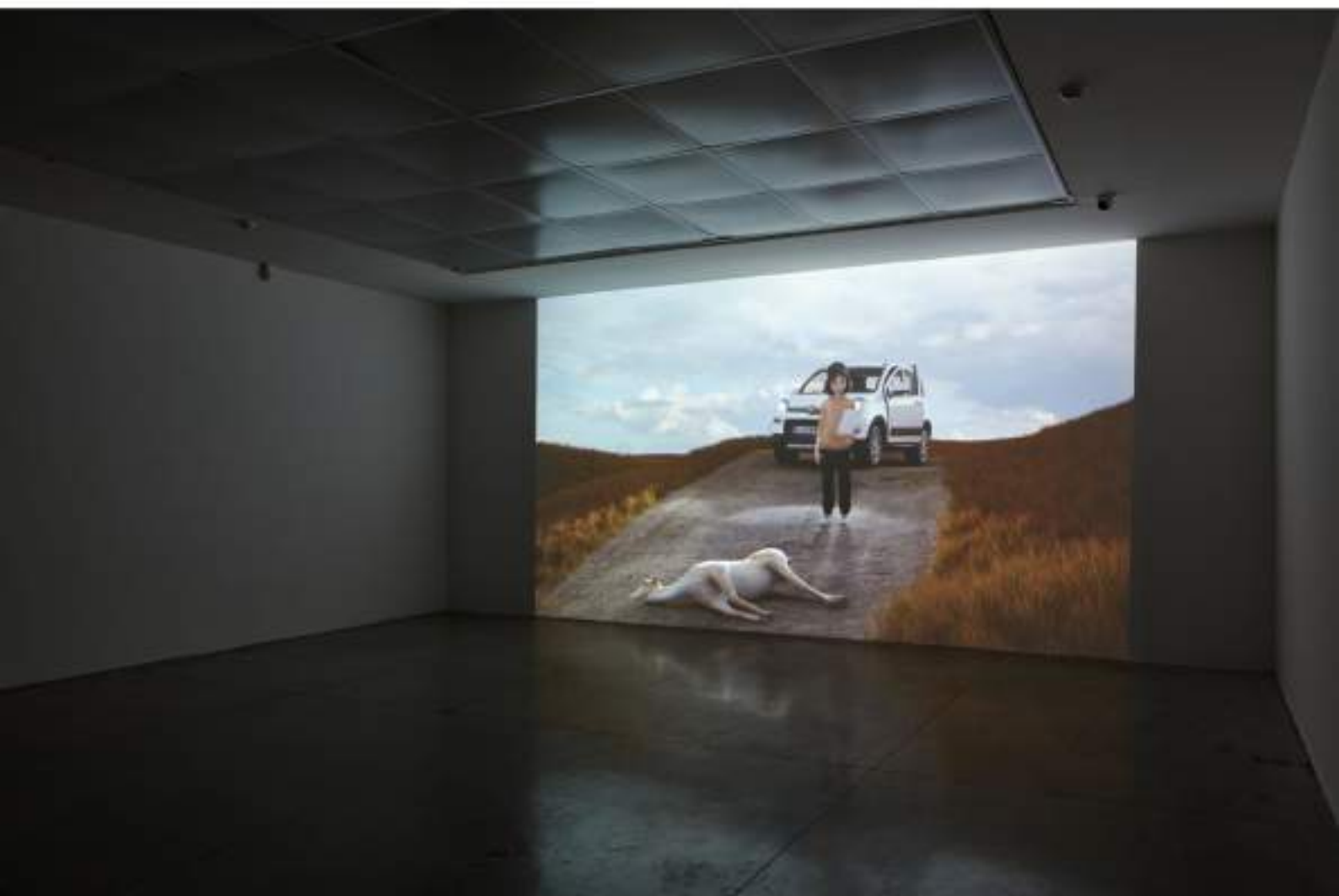
4 hours don't leave footprints, installation view, MAMbo - Museo d'Arte Moderna di Bologna, Bologna IT 2021, photo Carlo Faseno